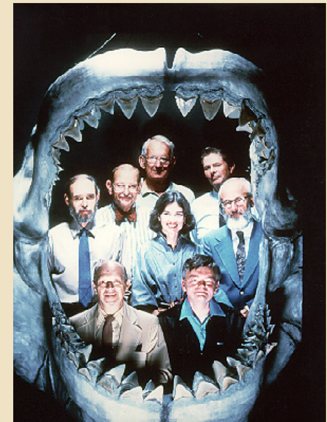
A modern, more accurate reconstruction